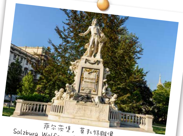
萨尔茨堡，莫扎特雕像 Salzburg, Wolfgang Amadeus Mozart Statue

乘坐巴士，沿着环城大道行驶，这里拥有众多建筑瑰宝，如国家歌剧院、国会议厅、市政厅、以及霍夫堡皇宫随后，参观美泉宫，以及欣赏宫殿奇妙的内部装饰并了解其迷人的历史。