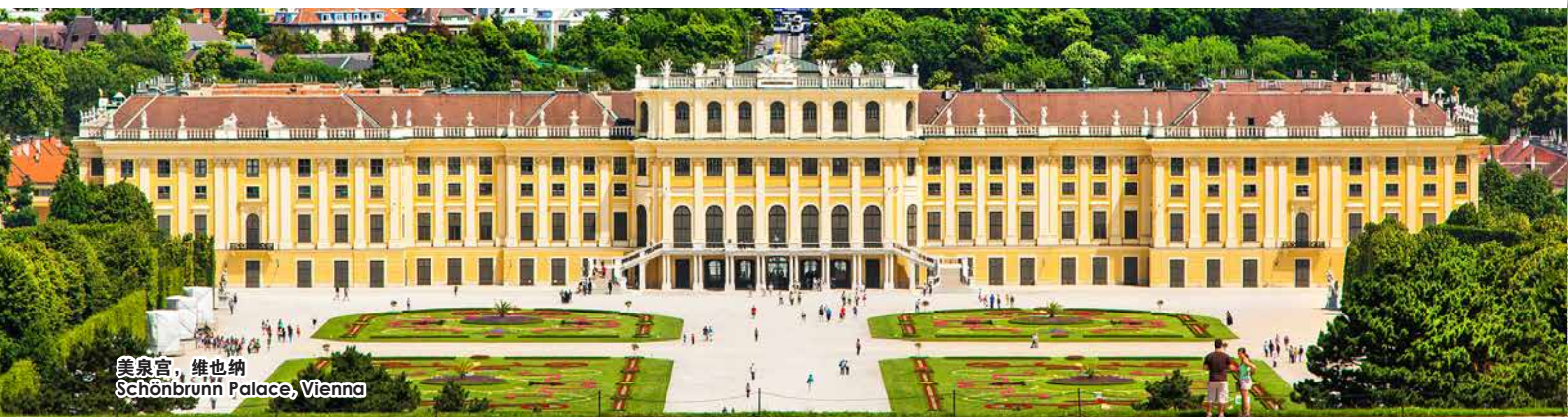
美泉宫, 维也纳 Schönbrunn Palace, Vienna